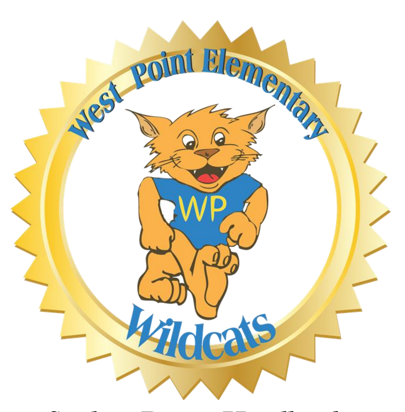
Student-Parent Handbook 2020-21

Phone: 801-402-2750 Fax: 801-402-2751 Attendance Line (call to report student absences): 801-402-2756